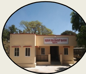
Dog Canal, Chitradurga ಒಳ-ಆರೋಗ್ಯ, ಅಭಿವೃದ್ಧಿ