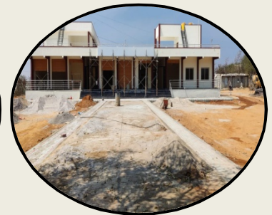
Community Welfare, Koppal