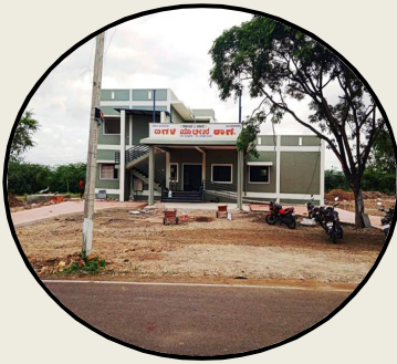
Aigali, Police Station