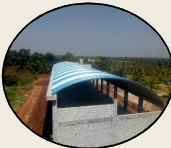
PST MT Shed, Kaduru