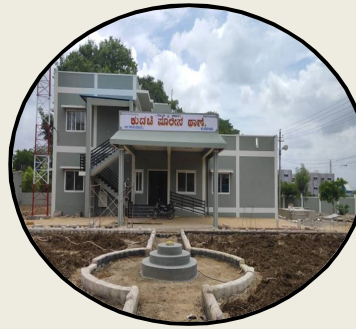
Kudachi, Police Station