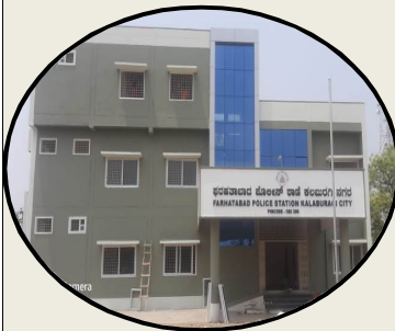
Farthabad, Police Station