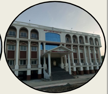
COP Office, Kalaburgi